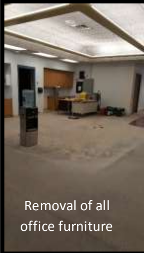
Removal of all office furniture