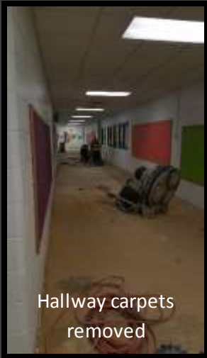
Hallway carpets removed

Apache Elementary has had a "facelift" and we're so excited to share our new changes with you. Over the summer crews were busy removing carpets, shelves, desks, and more to make a better look and of course a healthier environment for our amazing children. There is still work to be completed but we can't wait for you to see the new changes at Apache.