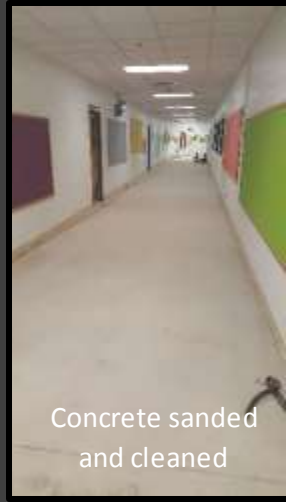
Concrete sanded and cleaned