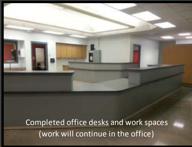
Completed office desks and work spaces (work will continue in the office)