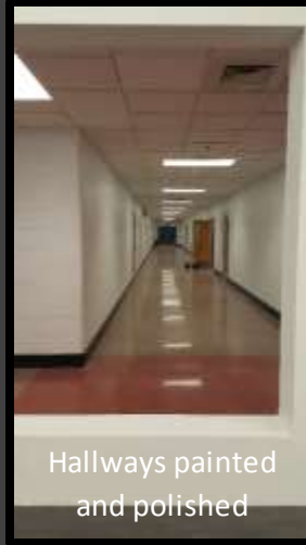
Hallways painted and polished