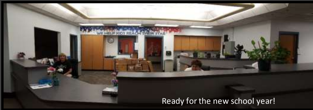
Ready for the new school year!